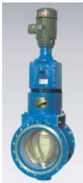
Model 2400 Super Shredder with 24" flanges.