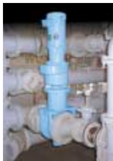
Super Shredder in sludge re-circulation line.