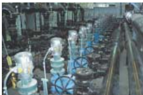
An arsenal of Super Shredders protects a major metropolitan wastewater facility.