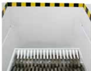
TASKMASTER® Shredder Hopper

MS10 Mobile Document Shredders employ TASKMASTER shredding technology to quickly and efficiently reduce high volumes of documents en-masse.