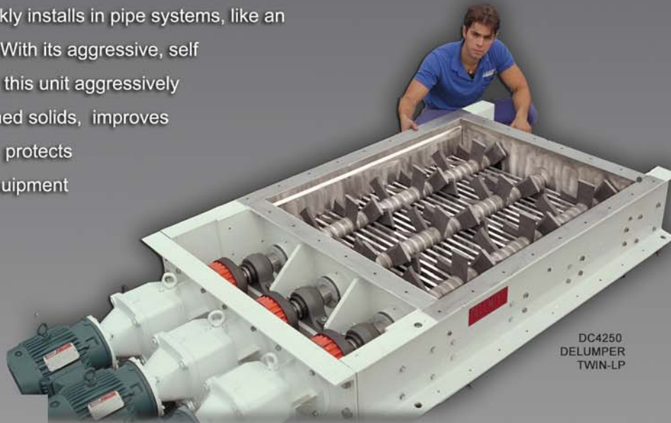
DC4250 DELUMPER TWIN-LP

The pressure-rated PIPELINE DELUMPER, inline processor, quickly installs in pipe systems, like an ordinary valve. With its aggressive, self clearing action, this unit aggressively reduces entrained solids, improves flow properties, protects downstream equipment and enhances processing.