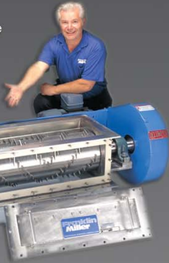
DELUMPER Model 2085L with special access door.

In fact, Franklin Miller specializes in matching proven solutions to specific process problems. From stock and customized machinery to fully integrated systems, we're cutting problem solids down to size in plant operations worldwide.