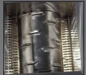
The S4's Smooth Drum and Comb

A once-through, non-churning, crushing action dependably reduces lumps to basic grain size without overgrind, heat rise or fines. These units are available with one-piece bodies and wide mounting flanges for easy connections in carbon steel, stainless steel or exotic alloys.