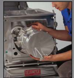
The S4's Easily Removable Drum